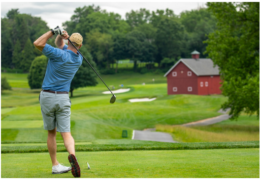
ANNUAL REPORT - 2018/2019 11

JA New York was proud to host two golf outings in the 2018-2019 fiscal year. Taking place at the esteemed Westchester Country Club and Leewood Golf Club, these events raised almost $300,000 combined.